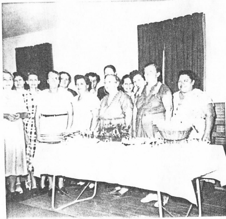
RELIEF SOCIETY BIRTHDAYS! 2nd picture is of 78 Birthday