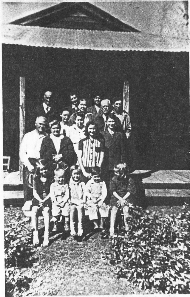
Home of Ellen Ladner, where early church meetings were held